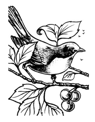
Copyright © Sermons4Kids, Inc. May be reproduced for Ministry Use