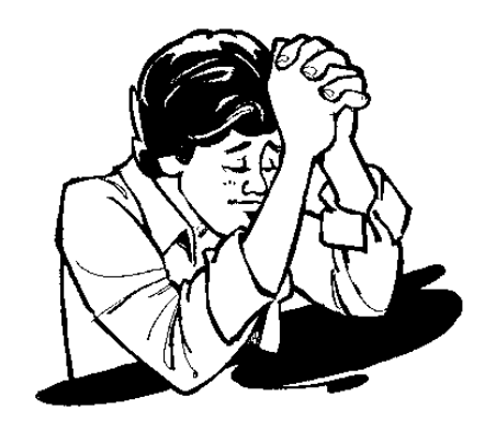
"God, have mercy on me, a sinner." Luke 18:13