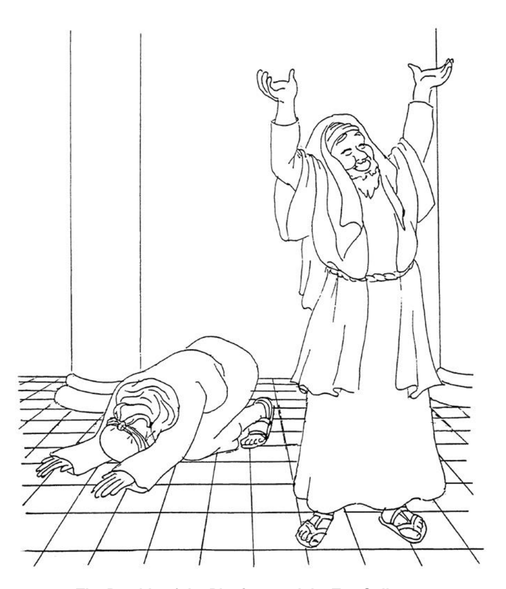
The Parable of the Pharisee and the Tax Collector