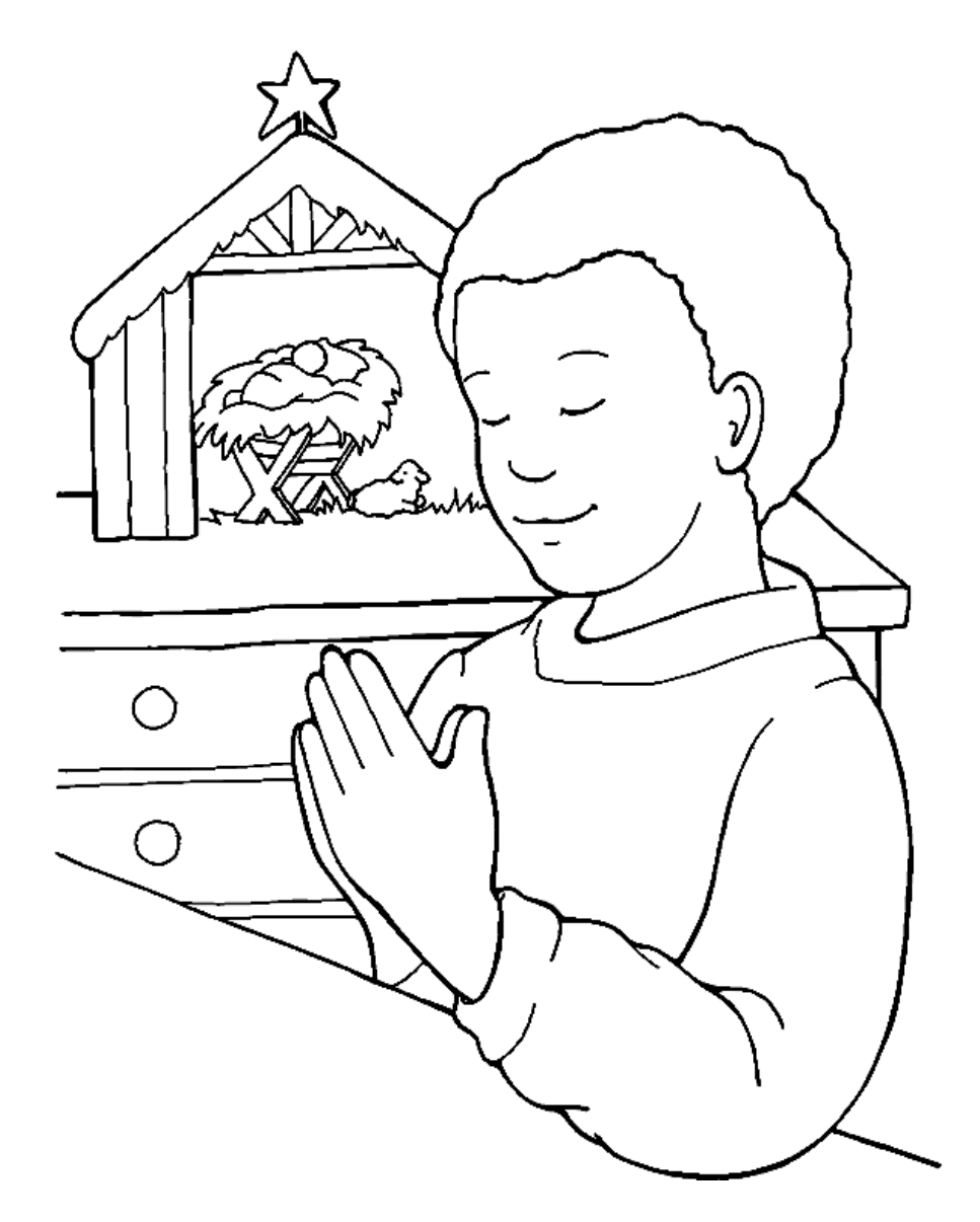
Thank you, God, for Jesus

From Thru-the-Bible Coloring Pages for Ages 4-8. © 1986,1988 Standard Publishing. Used by permission. Reproducible Coloring Books may be purchased from Standard Publishing, www.standardpub.com, 1-800-543-1301.