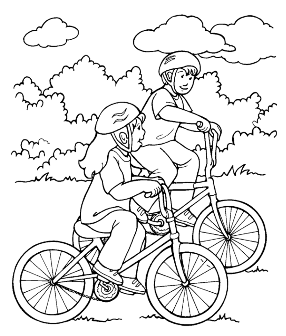
I can tell my friends about Jesus.

From Thru-the-Bible Coloring Pages for Ages 4-8. © 1986,1988 Standard Publishing. Used by permission. Reproducible Coloring Books may be purchased from Standard Publishing, www.standardpub.com, 1-800-543-1301.