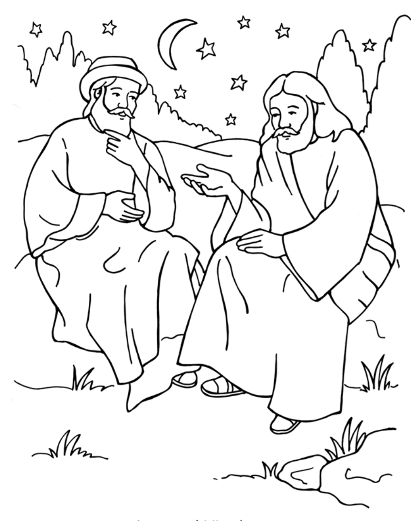
Jesus and Nicodemus John 3

From Thru-the-Bible Coloring Pages for Ages 4-8. © 1986,1988 Standard Publishing. Used by permission. Reproducible Coloring Books may be purchased from Standard Publishing, www.standardpub.com, 1-800-323-5473.