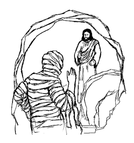
Copyright © Sermons4Kids, Inc. May be reproduced for Ministry Use