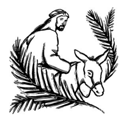
May be reproduced for Ministry Use