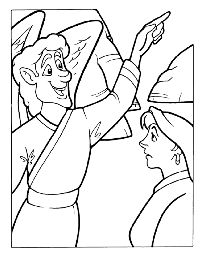
HE IS NOT HERE! HE IS RISEN!