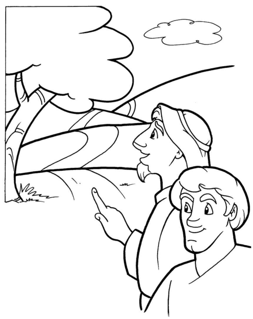
The Road to Emmaus

Copyright © CalvaryCurriculum.com Used by Permission