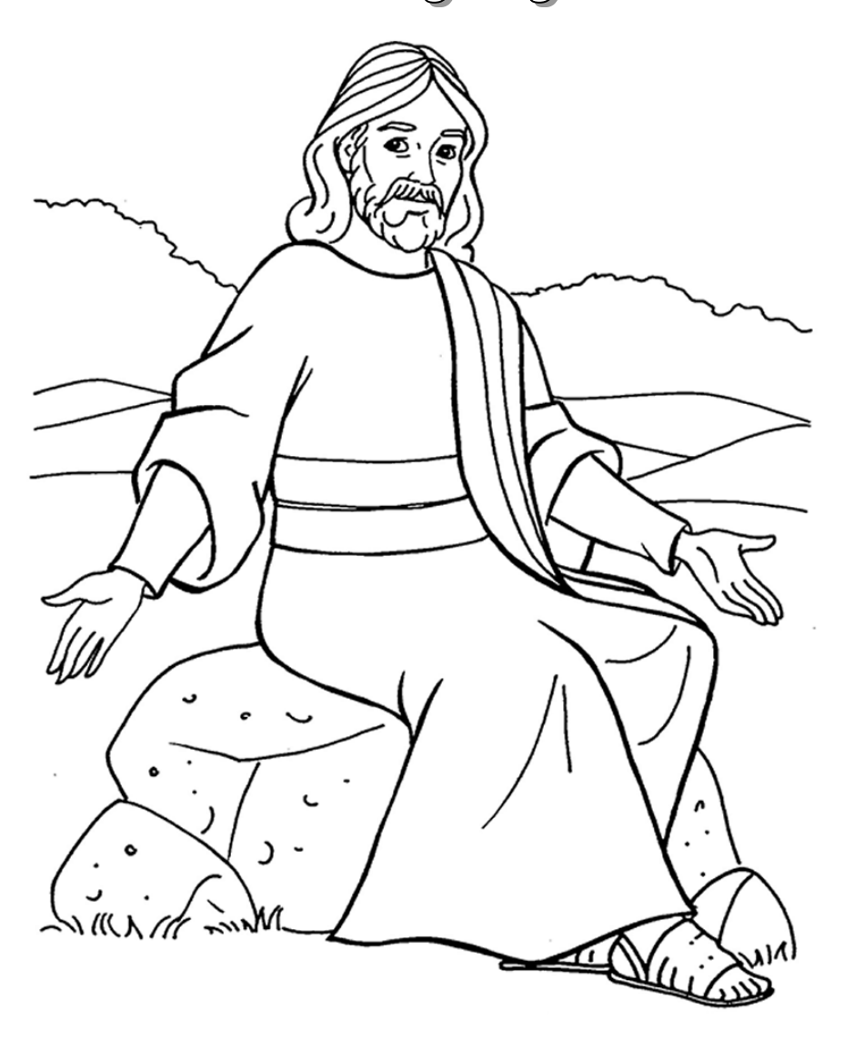
The Parable of the Weeds