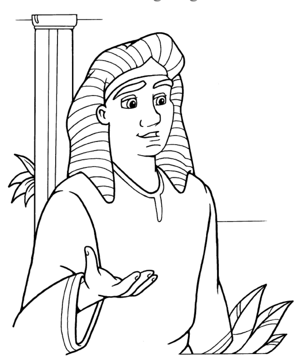
Joseph said to his brothers, "I am Joseph! Is my father still living?" Genesis 45:3

Copyright © CalvaryCurriculum.com Used by Permission