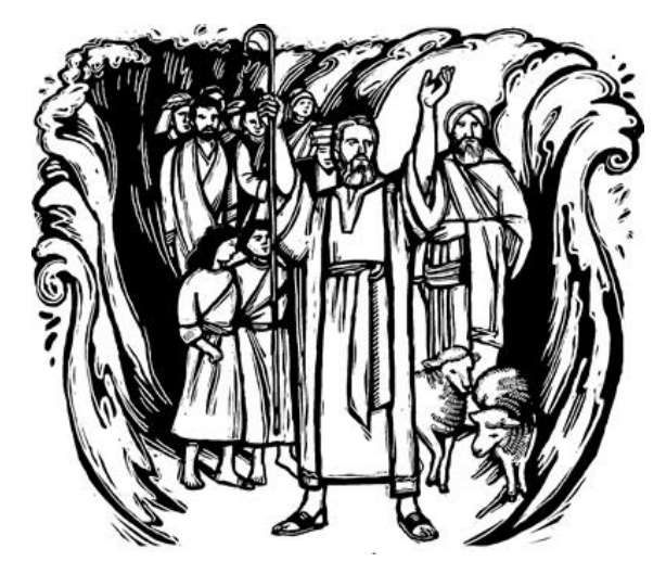
Copyright © Sermons4Kids, Inc. May be reproduced for Ministry Use