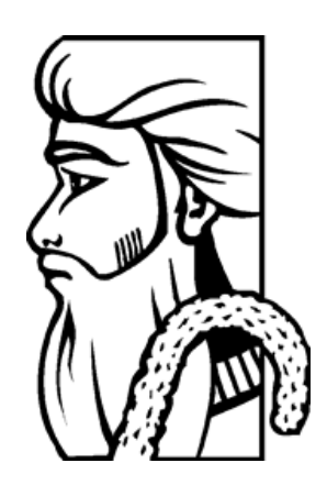
Copyright © Sermons4Kids, Inc. May be reproduced for Ministry Use