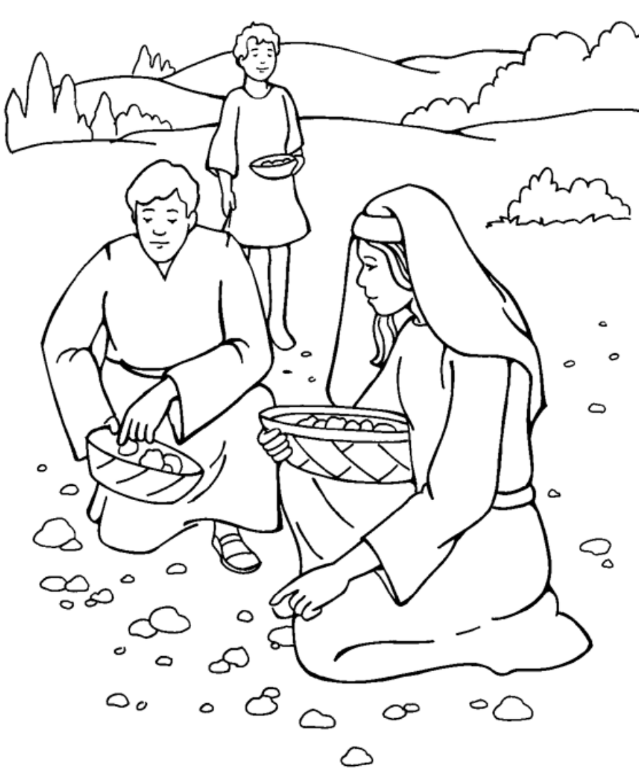
Moses said to them, "It is the bread that the LORD has given you to eat." Exodus 16:15

From Thru-the-Bible Coloring Pages for Ages 4-8. © 1986,1988 Standard Publishing. Used by permission. Reproducible Coloring Books may be purchased from Standard Publishing, www.standardpub.com, 1-800-543-1301.