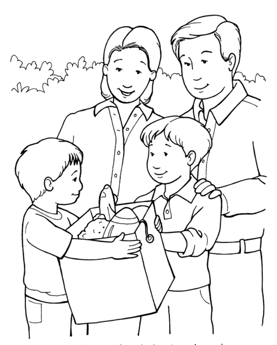
I can show my friends that Jesus loves them.

From Thru-the-Bible Coloring. © 1986,1988 Standard Publishing. Used by permission. Reproducible Coloring Books may be purchased from Standard Publishing, <a href="https://www.standardpub.com">www.standardpub.com</a>, 1-800-323-7543