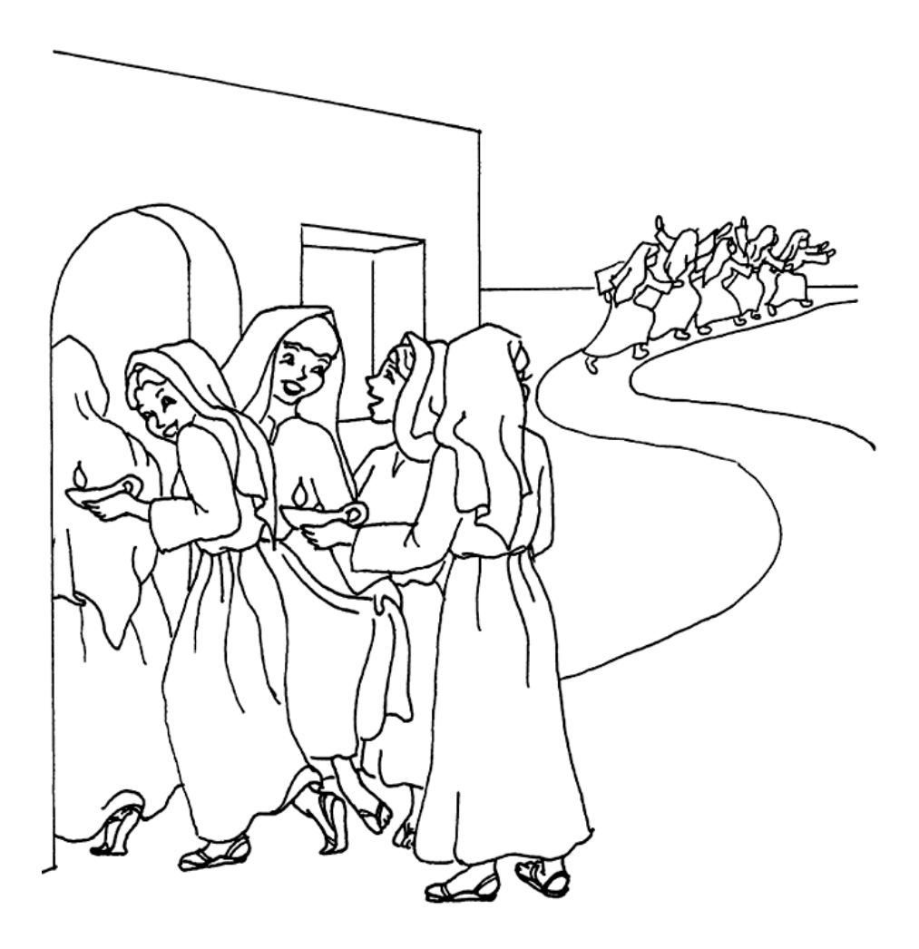
The Parable of the Ten Bridesmaids Matthew 25:1-13