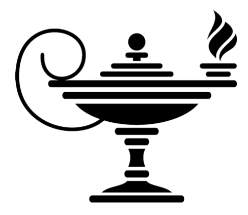
Copyright © Sermons4Kids, Inc. May be reproduced for Ministry Use