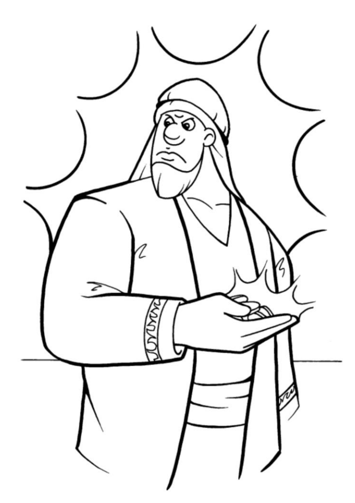
Parable of the Talents (Matthew 25:14-30)