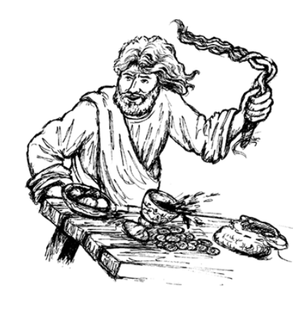
Copyright © Sermons4Kids, Inc. May be reproduced for Ministry Use