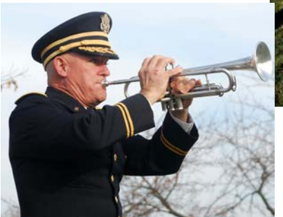
Remember the fallen