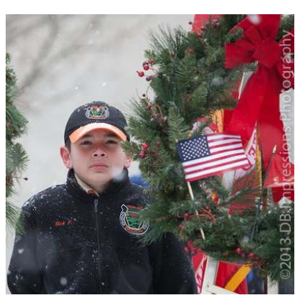
Plan to Join Us for the Ceremony & to Help Place Wreaths on Veteran's Graves