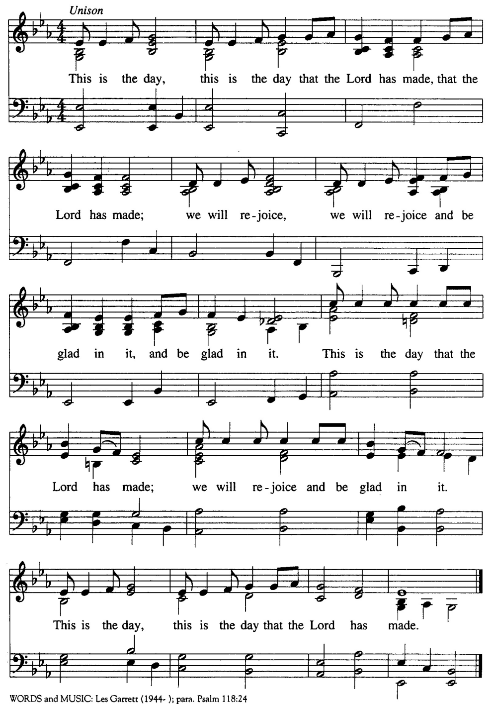
Words and Music © 1967 Scripture In Song (a div. of Integrity Music)

Used with Permission One License #A-728042