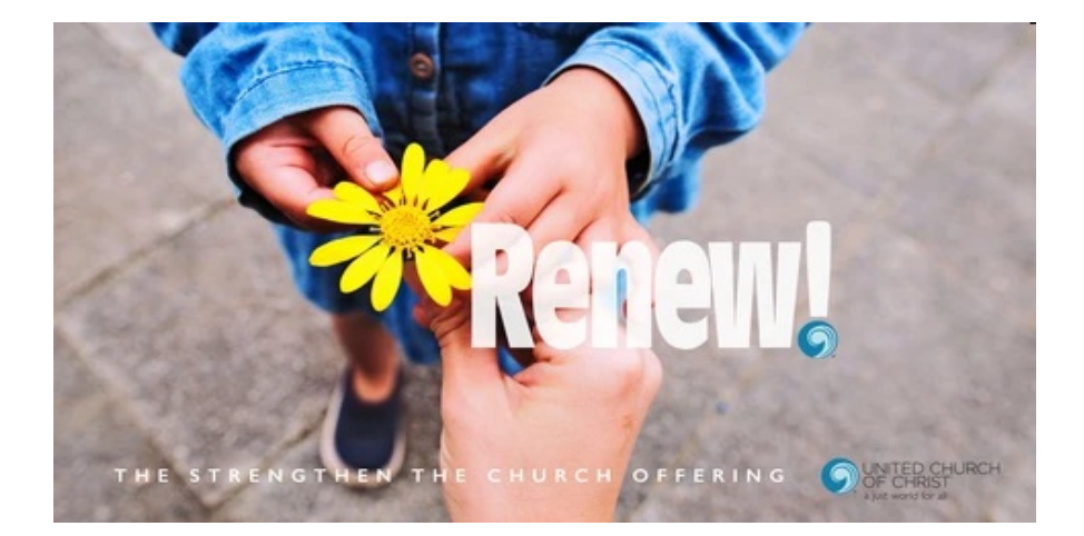
Reset for Renewal

Part of the Strengthen the Church Offering supports youth and young adult ministry. 2020 scrabbled many plans for such ministries, including the delay of the much-appreciated National Youth Event. Youth and Young Adult Ministers wondered how to effectively reach out during the pandemic and sought peers' support.