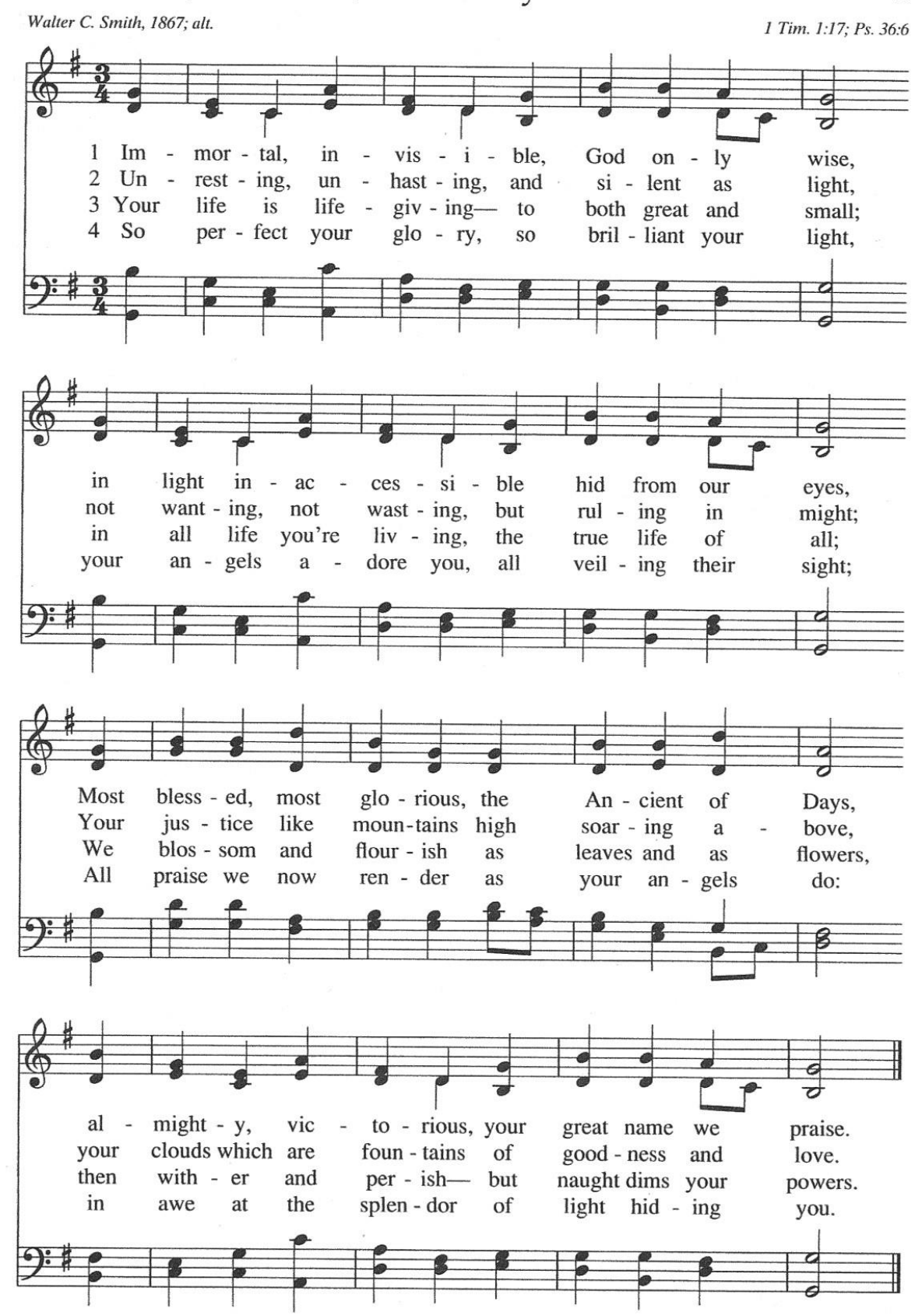
Walter C. Smith, minister of the Free Church of Scotland and later moderator of the Assembly, wrote poetry as a retreat from work and to say what could not be fully expressed in the pulpit.