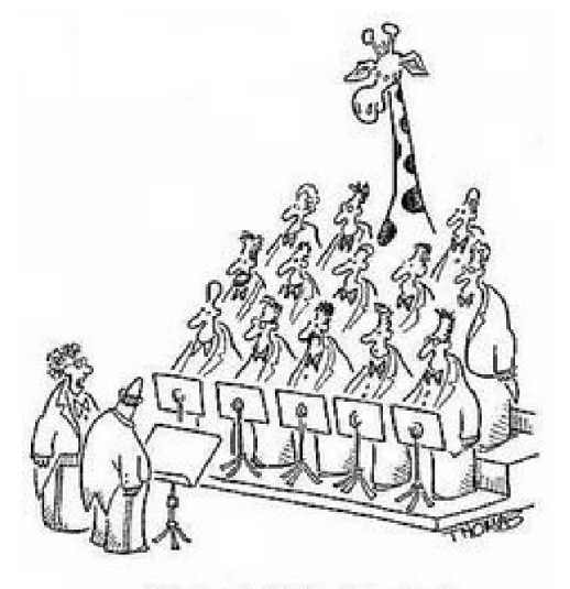
"He's here to hit the high notes."

We are proud to be God's people; We represent all shades and hues. When we work together here We can witness without fear We can confidently show and share Good News.