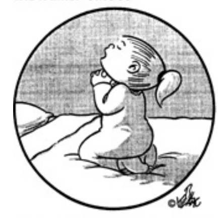
"...lead us not into temptation, but deliver us