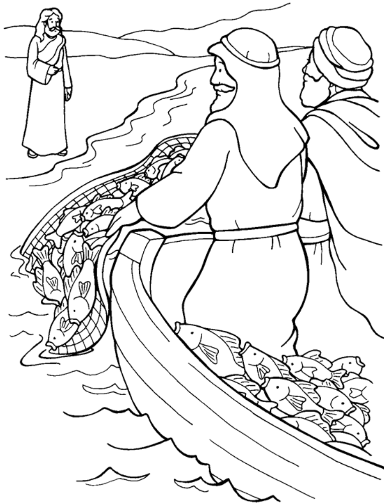
Jesus calls four of his disciples.

From Thru-the-Bible Coloring Pages for Ages 4-8. © 1986,1988 Standard Publishing. Used by permission. Reproducible Coloring Books may be purchased from Standard Publishing, www.standardpub.com , 1-800-543-1301.