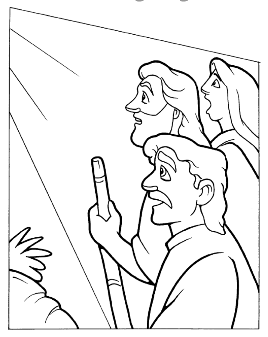
"This is my Son, whom I love; with him I am well pleased. Listen to him!" Matthew 17:5b (NIV)

Copyright © CalvaryCurriculm.com Used by Permission