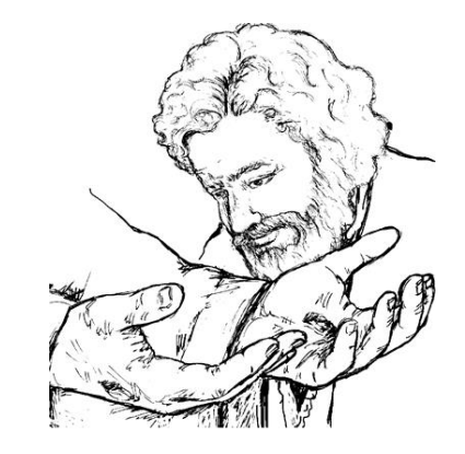
Copyright © Sermons4Kids, Inc. May be reproduced for Ministry Use