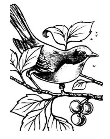
May be reproduced for Ministry Use