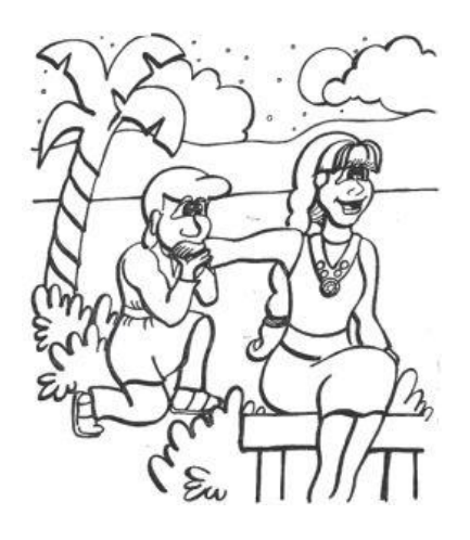
Copyright © Sermons4Kids, Inc. May be reproduced for Ministry Use