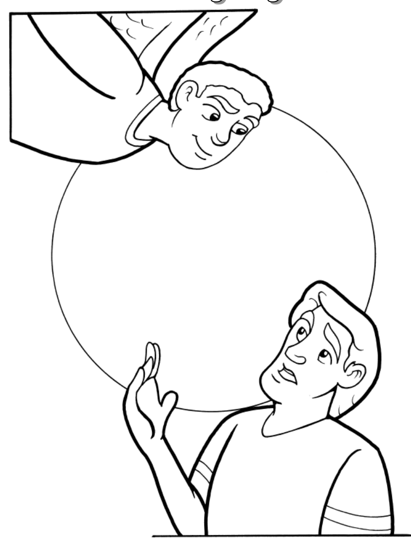
Your Name Shall Be Israel Genesis 32:28