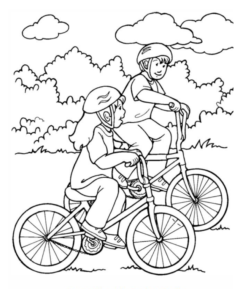
I can tell my friends about Jesus.

From Thru-the-Bible Coloring Pages © 1986,1988 Standard Publishing. Used by permission. Reproducible Coloring Books may be purchased from Standard Publishing, www.standardpub.com, 1-800-323-7543.