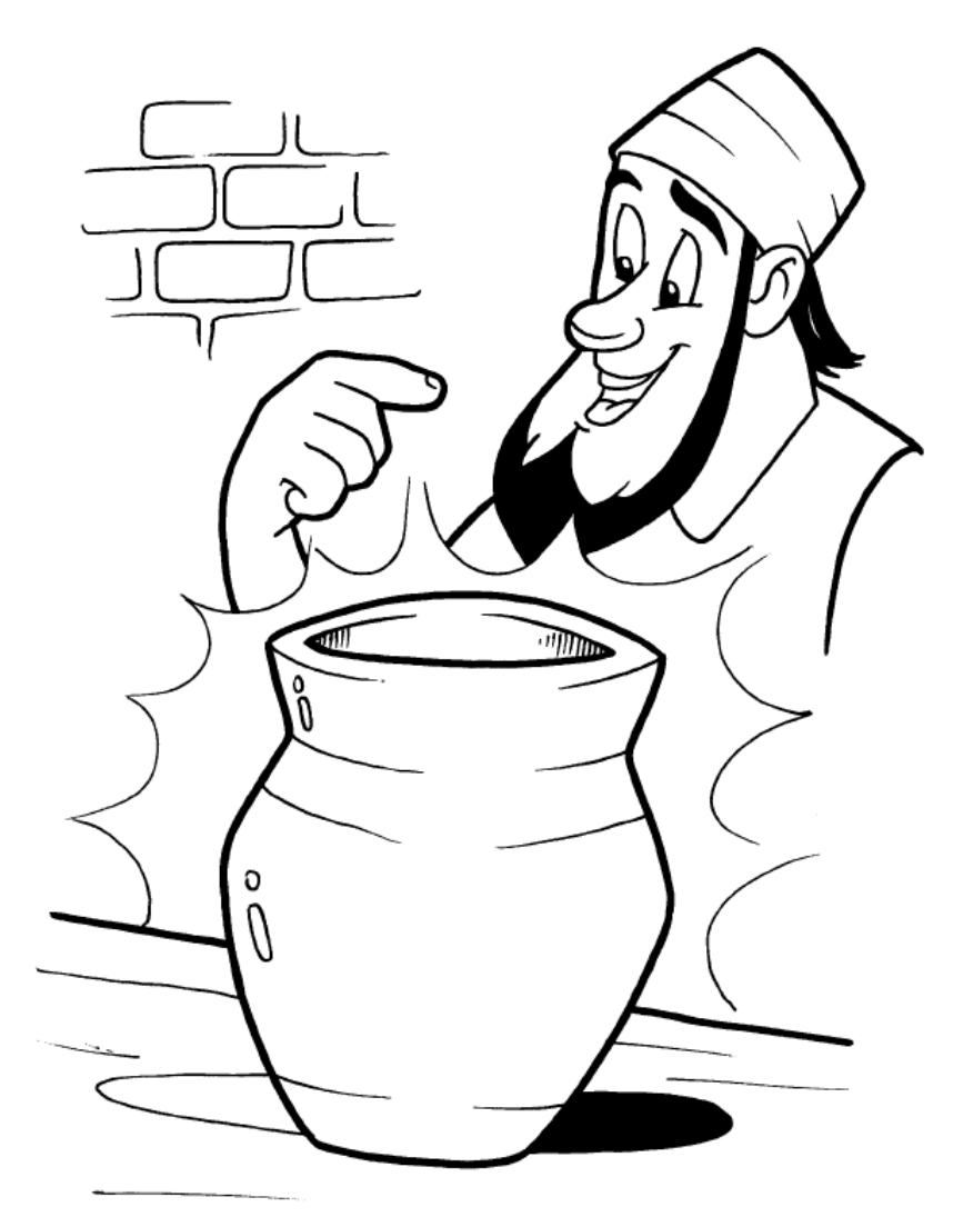
We are the clay, you are the potter; we are all the work of your hand. Isaiah 64:8

Copyright © Calvary Curriculum Used by Permission