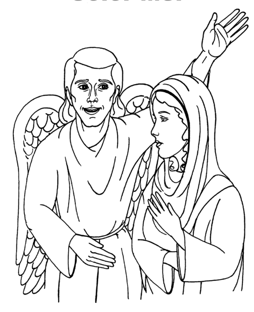
The Angel Gabriel Appears to Mary Luke 1:26-38