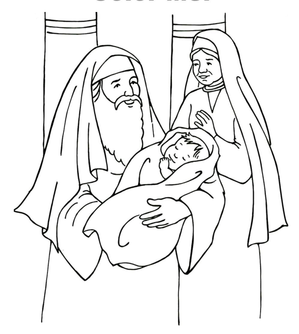
Simeon and Anna Thank God

From Thru-the-Bible Coloring Pages for Ages 4-8. © Standard Publishing. Used by permission. Reproducible Coloring Books may be purchased from Standard Publishing, www.standardpub.com, 1-800-543-1301.