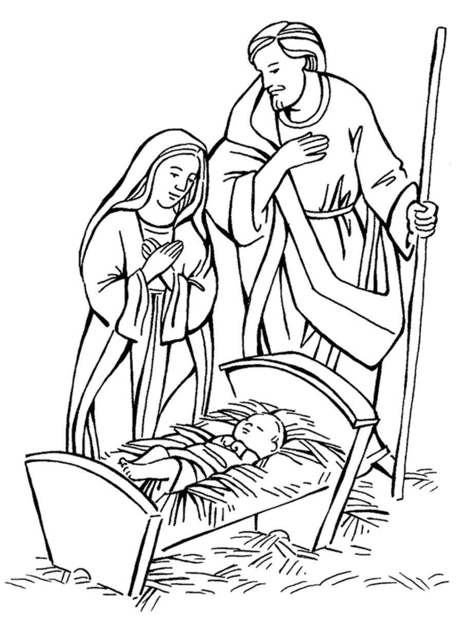
The Word became flesh and made his dwelling among us. John 1:14