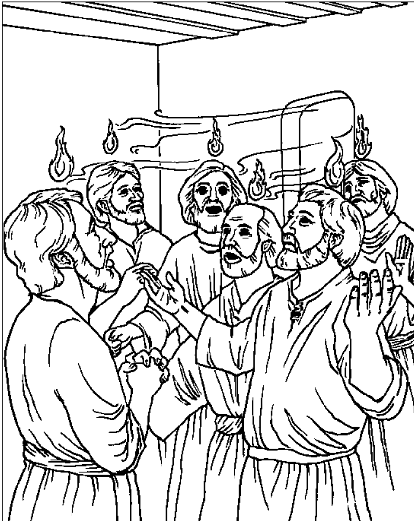
The Day of Pentecost Acts 2