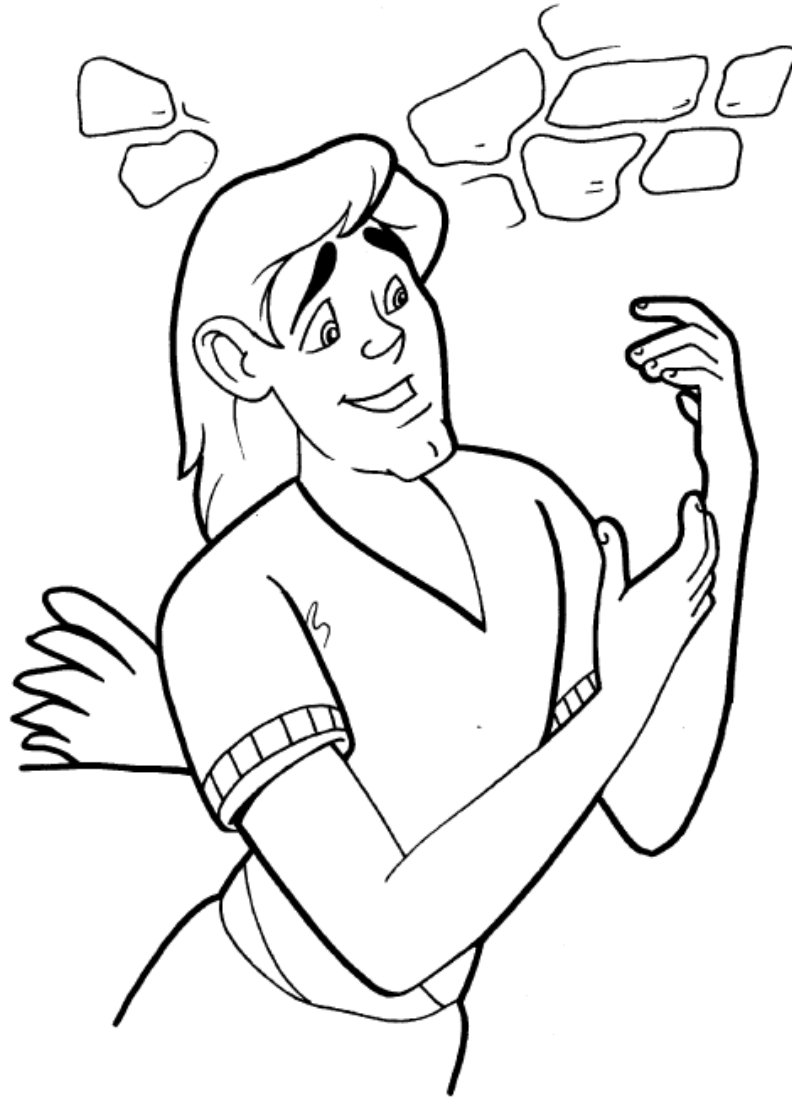
Jesus Heals a Withered Hand Mark 3:1-6

Copyright © CalvaryCurriculum.com Used by Permission