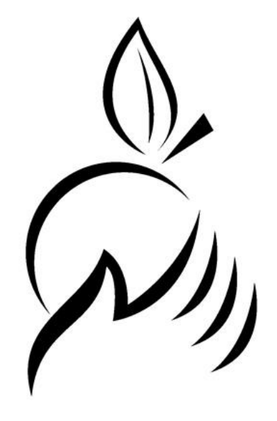
Copyright © Sermons4Kids, Inc. May be reproduced for Ministry Use