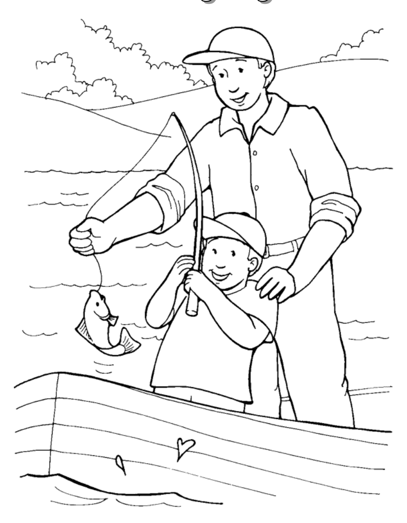
"Come with me by yourselves to a quiet place and get some rest." Mark 6:31

From Thru-the-Bible Coloring Pages © 1986,1988 Standard Publishing. Used by permission. Reproducible Coloring Books may be purchased from Standard Publishing, www.standardpub.com, 1-800-323-7543.