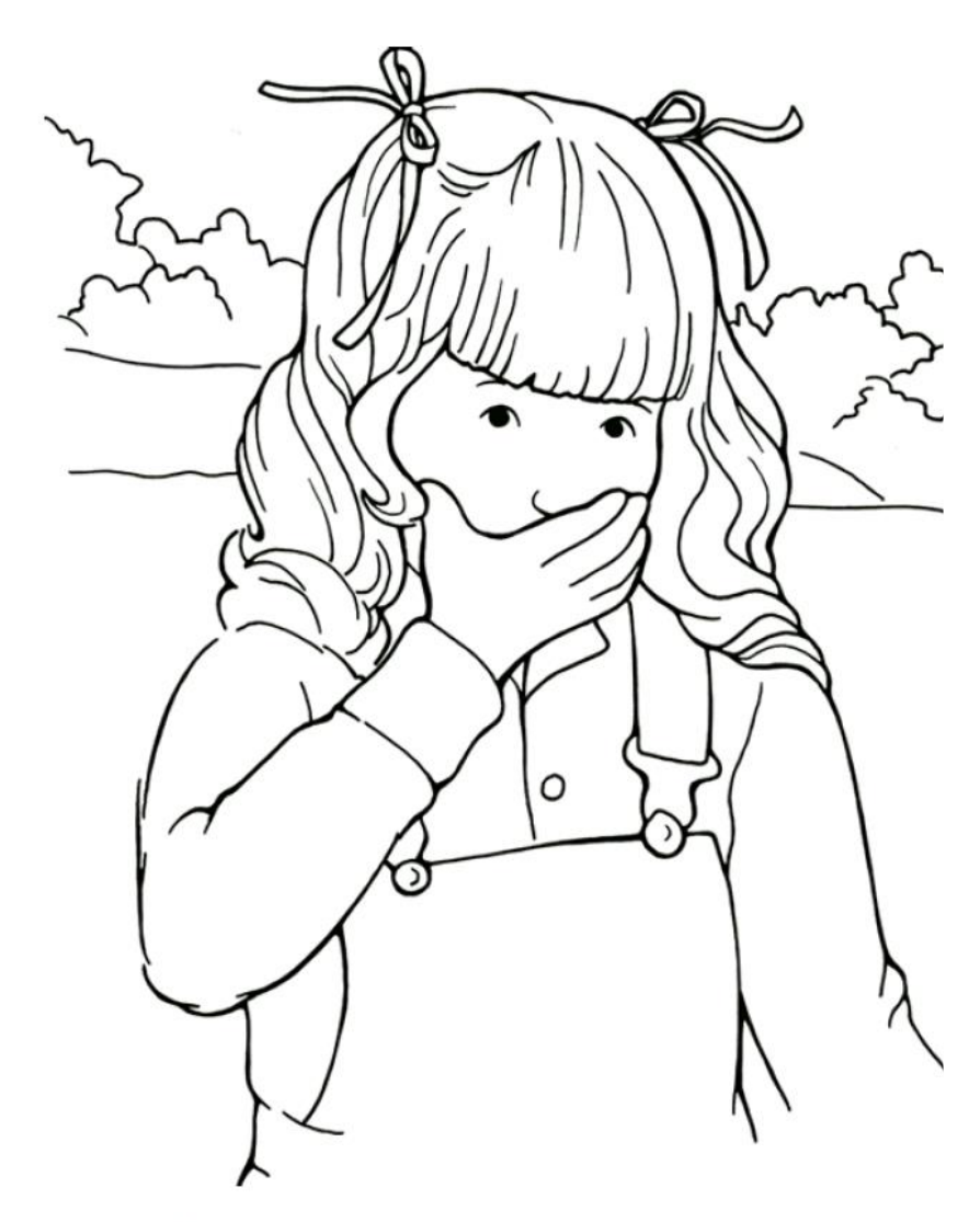
"Lord, help me control my tongue. Help me to be careful what I say."

From Thru-the-Bible Coloring Pages. © 1986,1988 Standard Publishing. Used by permission. Reproducible Coloring Books may be purchased from Standard Publishing, www.standardpub.com, 1-800-323-5473.